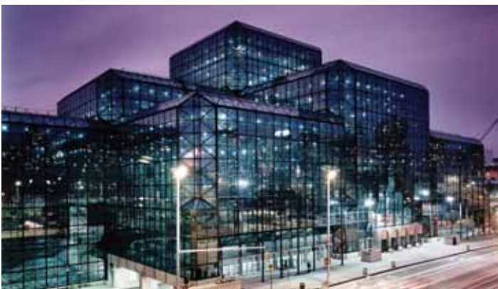
The Javits Convention Center in New York City will host SC World Congress 2008

Located in New York City at the heart of world commerce, SC World Congress serves the requirement for an expo and conference that focuses on the real information needs of IT security and corporate management. Within a three hundred mile radius of New York City sits the largest concentration of corporate headquarters and federal/local government offices in the United States. This is where the need for the latest technologies and solutions to protect valuable data is at its highest and where the budgets supporting information security are the largest.